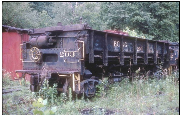
BC&G Clark side dump gon #203.

The Official Railway Equipment Registry shows that two steel gondolas numbered 502 and 503 were on the property in 1957, although no good photos have surfaced of these cars. I represent them with built from AF bodies with new trucks and other details added. Similarly, a couple of flat cars are rostered although only good photos of #107 have surfaced. That car can be modeled from any commercially available flat, like those from American Models, or from AF bodies with details added.