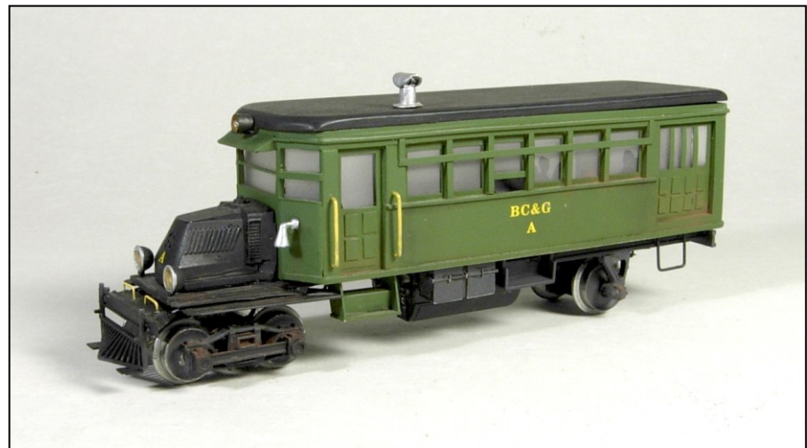
Scratchbuilt model of Motor "A" built by estimating dimensions from photos

The second railbus on the BC&G roster was Motor "B". It was a two-axle, four-wheel affair that even in S would be a small model. No commercial model exists and as of now I've not tried to model it. Perhaps the reader will take that one on! Dimensioned drawings are available.