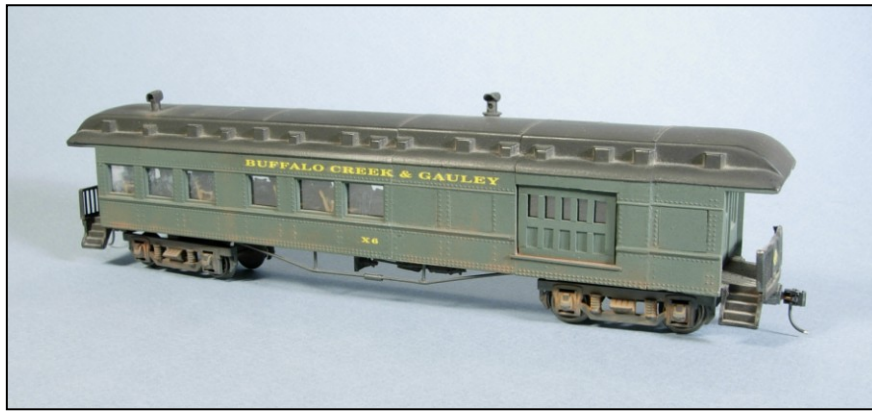
X-6 modeled from 2 AF observation cars

Examples include the 60' truss rod combine kit available from 'S'cenery Unlimited.