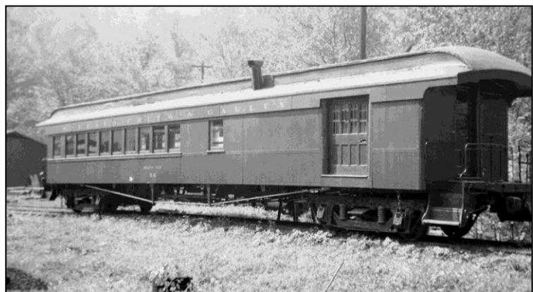
1910-built BC&G Dining Car X-6 in Dundon yard circa 1958

The BC&G had a wonderful, eclectic assortment of rolling stock, all second hand. The road rostered three old coaches which served as cabooses as well as carrying passengers until the line got its first traditional caboose in 1958. One, #X-6 was an ex-Reading combine that was converted to a MOW dining car. While I built my representation by splicing together parts from two American Flyer observation cars and scratchbuilding the sliding door any clerestory-roofed combine with platforms on each end would make a suitable representation.