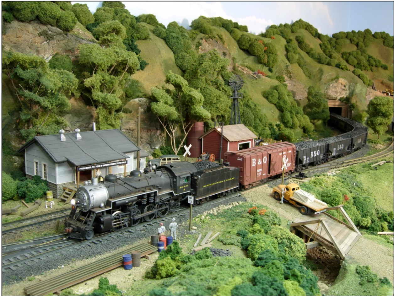
BC&G #4 ( SHS locomotive) is heading back to the interchange with a string of loaded hoppers (modified AF cars) and box car (Lehigh Valley kit) that had carried supplies to the mine in this photo on the author's layout inspired by David Marquis' photo on the preceding page

weathered, they looked fine. Now 2-bay hoppers with that B&O paint scheme are available from S Helper Service and 3-bay units are available from American Models. AM also has 2- and 3-bay hoppers in the older B&O scheme. Of course a variety of other eastern road hoppers appeared on BC&G rails (WM, Reading, NYC) and models of these roads are readily available in S. Similarly a number of B&O box cars are available from SHS and AM and Leigh Valley Models produced a kit of a B&O wagon top box car, one of which is visible in the photo below.