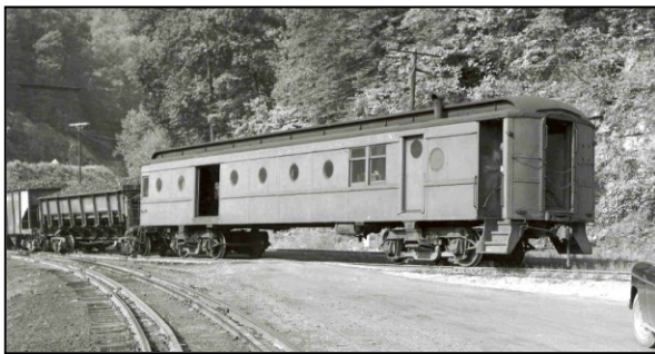
BC&G #16 - John Armstrong 9-51

The PRR added "porthole" windows and coach seats. The BC&G acquired them in 1949 for $1500 each. American Models RPO cars (below right) can be used as the basis for models of these two distinctive cars. The AM cars, or other similar models, can be heavily reworked to be accurate models or, as I did, model less rigorously but still capture the character of the prototypes.