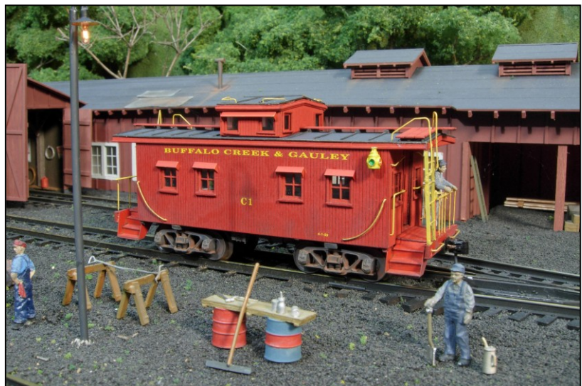
A Supply Car, LLC B&O I-1 kit lettered as the BC&G C-1

In 1959 the BC&G acquired two I-1 cabooses from the B&O. These were the first traditional cabooses ever owned by the line! One was put in service as C-1; the other was stored until the line closed. For years I made due on my layout with a modified American Flyer Reading steel caboose as it had the correct exterior profile and size. But now the Supply Car, LLC offers a wonderfully accurate laser-cut kit of the I-1 that only needs lettering to make a spot-on replica of C-1.