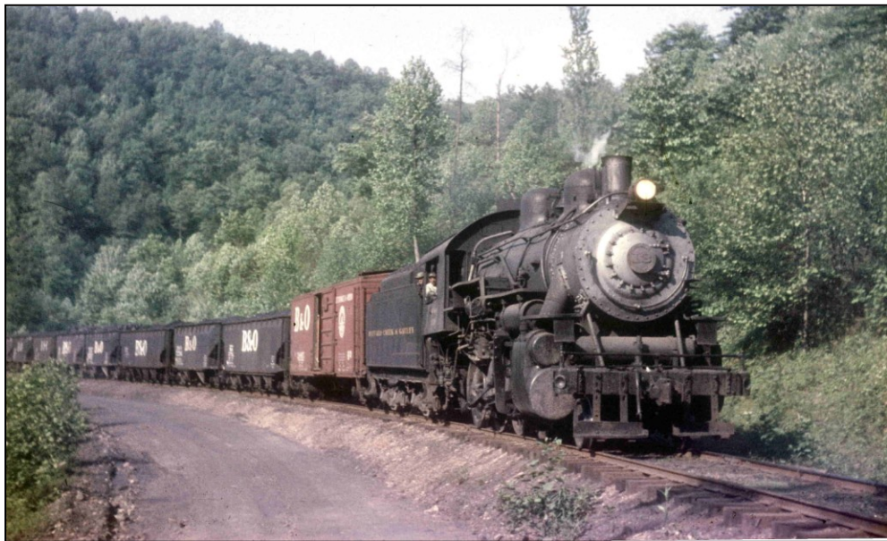
Typical BC&G consist in the late 1950s. Visible are B&O hoppers and a B&O box car probably with supplies for the sawmill or the mine.

As the BC&G interchanged only with the B&O, many of the cars that appeared on BC&G rails were B&O cars. The vast majority of hoppers that came and went from the Rich Run mine were B&O two-bay hoppers with some three-bay units seen in photos. For the most part in the period modeled, the cars wore the