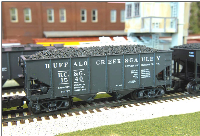
S Helper Service's BC&G steel hopper

While it might seem unusual for a railroad only 18.6 miles long, the BC&G had 900 50-ton two-bay steel hoppers in revenue service from the 1920s until their sale to the B&O in 1944. Even after that, about a half dozen of these cars remained in MOW service. Years ago I built a couple of models of these cars using AF shells and custom decals. Now S Helper Service makes very nice replica of the BC&G hopper in four road numbers making this the only piece of RTR BC&G rolling stock available in S.