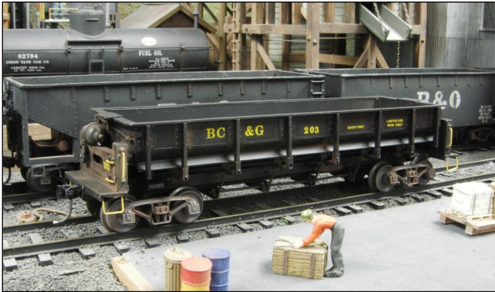
One of two BC&G Clark side dump gondolas scratchbuilt by the author

task, six of the cars were refurbished by the BC&G crews and were then used in MOW service. After determining that the only way to get a representative model of the cars was to scratchbuild them, with the help of Don Thompson of S Helper Service, I found an 1”:1’ engineering