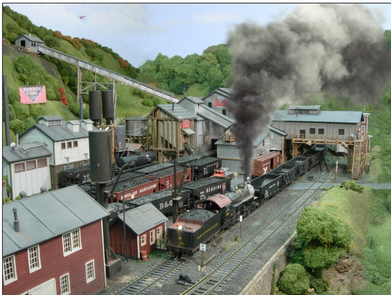
BC&G #13 is switching the Rich Run Mine at Widen as modeled on the author's S scale layout