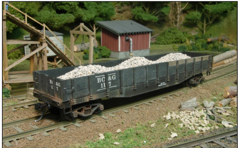
BC&G #117 built from an AF flat car body with wood sides

BC&G crews converted two fish-belly flat cars to wood-sided gondolas. These cars were numbered #116 and #117 in 1958 although it appears the cars changed configuration and numbers over the years. It's relatively easy to build models of these cars by adding side boards to flat cars by American Models or, as I did, American Flyer flat car bodies with new trucks and other details, like grab irons, added.